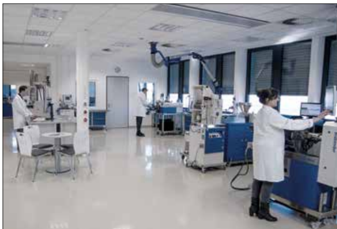
Brabender application laboratory