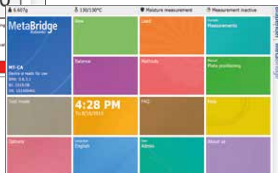
Clear start screen