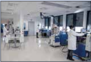
Brabender application laboratory

An oscillating unit ensures even and steady winding of the extrudate. The oscillating speed is controlled automatically as a function of the preset haul-off speed and of the extrudate and coil diameters. In order to achieve a perfect winding result, the tension between the nip rolls and the oscillating unit can be adjusted. The full coil can easily be taken off and stored or be used for further tests.