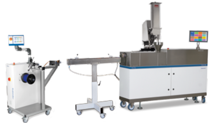
Compounding line with TwinLab-C 20/40 with round strand die head, water bath and Winder