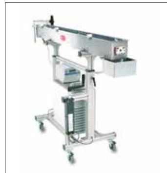
AquaTrough – Brabender CWB water bath