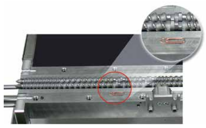
Miniature screws compared with a paper clip

This procedure is commonly employed when using a single-screw extruder. For a twin-screw extruder, however, it is only used when it is a necessary part of the process.